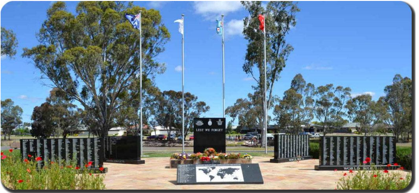
Horsham & District War Memorial & Cenotaph